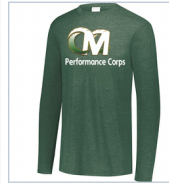
Augusta Sportswear Tri-Blend Tee $21.00 $22.99 3 Colors