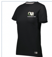
Left Chest Print - Russell Athletic Ladies Essential Tee $19.00 3 Colors