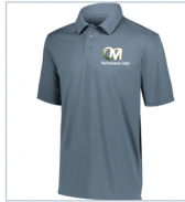
Black and Grey Augusta Sportswear Vital Polo $22.00 2 Colors