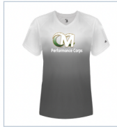
Badger Ombre Womens V-Neck Tee $21.00 2 Colors