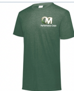
LC Augusta Sportswear Tri-Blend Tee $20.00 $20.99 2 Colors