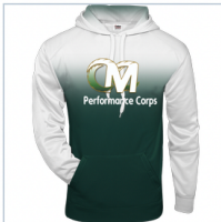
Badger Ombre Hood $44.00