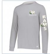
LC and Sleeve Russell Athletic Ladies Essential Tee $20.00 4 Colors