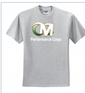
Jerzees Dri-Power 50/50 Cotton/Polu T-Shirt $17.00 4 Colors