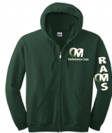
LC SLV Gildan Heavy Blend™ Full-Zip Hooded Sweatshirt $38.00 2 Colors