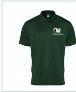
Dark Green C2 Utility Polo $22.00