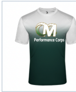
Badger Ombre Tee $21.00 2 Colors