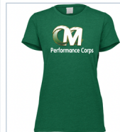
Augusta Sportswear Ladies Tri-Blend Tee $20.00 3 Colors