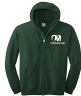
Gildan Heavy Blend™ Full-Zip Hooded Sweatshirt $33.00 2 Colors