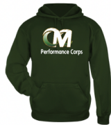
Badger Sport Perf. Fleece Hood $33.00 5 Colors