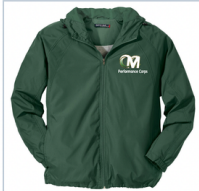
Sport-Tek Hooded Raglan Jacket $33.00