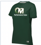
Russell Athletic Ladies Essential Tee $19.00 4 Colors