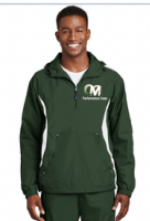
Sport-Tek Colorblock Raglan Anorak $39.00