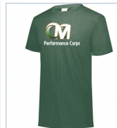
Augusta Sportswear Tri-Blend Tee $20.00 2 Colors