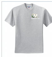
Left Chest Jerzees Dri-Power 50/50 Cotton/Polu T-Shirt $17.00 4 Colors