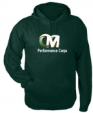
C2 Fleece Hood $28.00 4 Colors