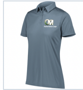
Black and Grey Augusta Sportswear Ladies Vital Polo $22.00 3 Colors