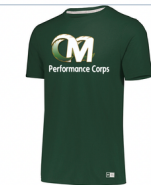
Russell Athletic Essential Tee $19.00 5 Colors