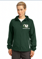
Sport-Tek Ladies Colorblock Hooded Raglan Jacket $33.00