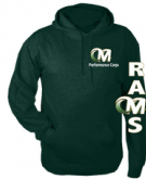
LC SLV C2 Fleece Hood $33.00 4 Colors